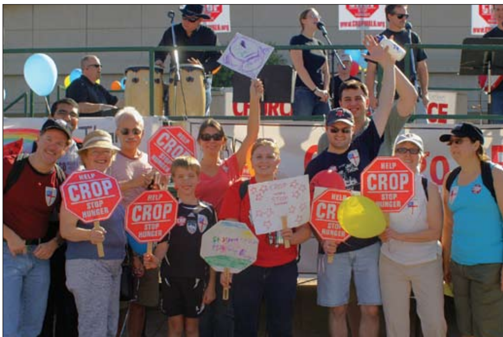
■ At the Cathedral Participating in CROP Walk (see article on page 6)