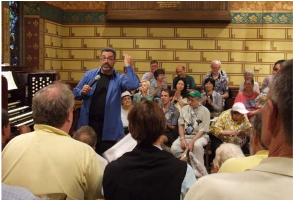
■ At the Cathedral A tour of the Cathedral organ