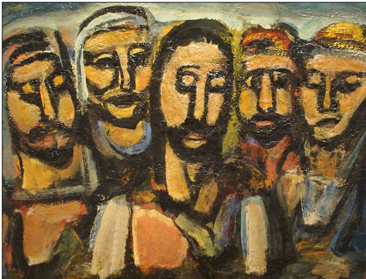
"Jesus with Disciples" Georges Rouault

Holy Eucharist Third Sunday of Easter April 14, 2024 at 11 a.m.