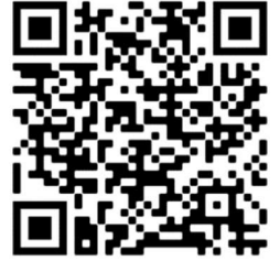
THIS WEEK'S ENEWS