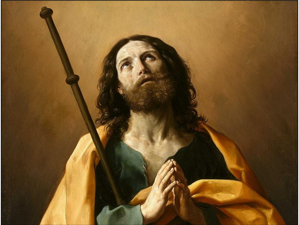
"Saint James the Great" by Guido Reni

Holy Eucharist The Feast of St. James the Apostle July 25, 2021 at 9 a.m.