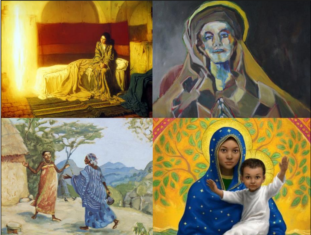
Images of Mary