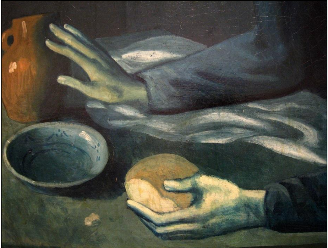
"The Blind Man's Meal" by Pablo Picasso

Holy Eucharist Twenty-Second Sunday after Pentecost October 24, 2021 at 11 a.m.