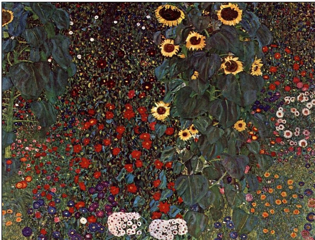
"Garden with Sunflowers" by Gustav Klimt

Holy Eucharist Easter Day April 17, 2022 at 8 a.m.