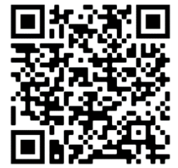
THIS WEEK'S ENEWS