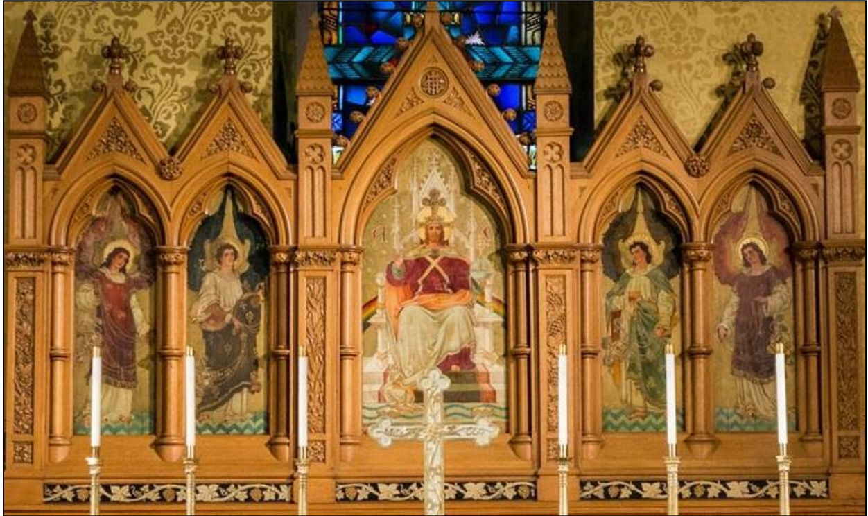
The Cathedral Reredos