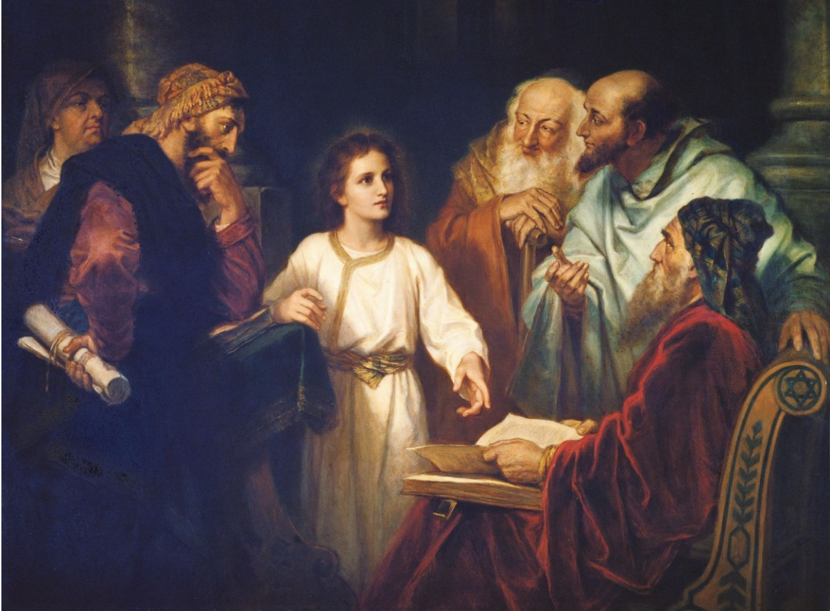
"Christ in the Temple" by Heinrich Hofmann (1824-1911)