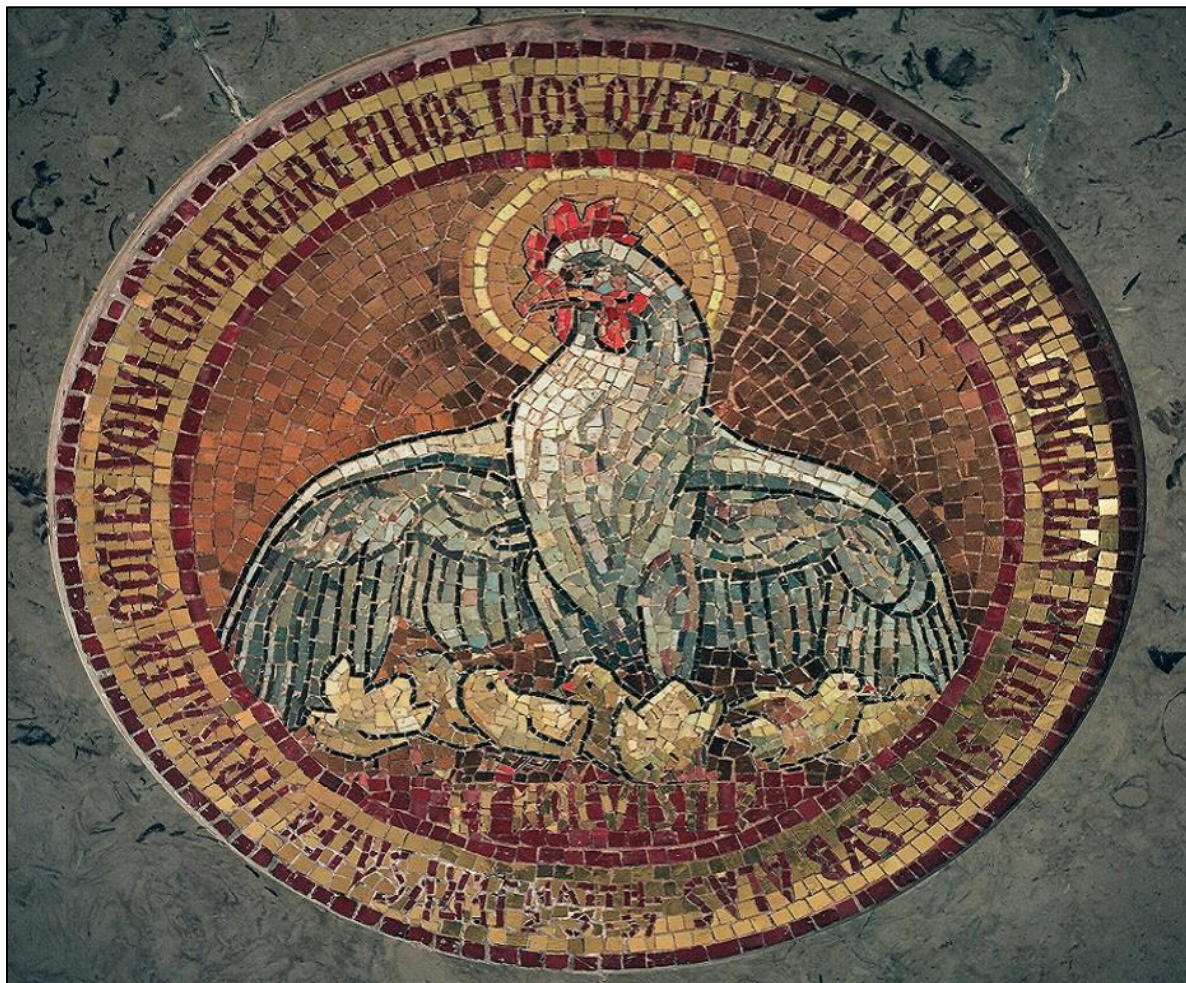
Altarpiece at the Church of Dominus Flevit on the Mount of Olives