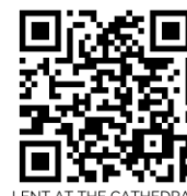
LENT AT THE CATHEDRAL