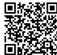
THIS WEEK'S ENEWS

ACOLYTE & ALTAR GUILD RETREAT April 5: A retreat for all current altar servers as well as anyone who wants to learn more about becoming a member of the Altar Guild or helping serve as an acolyte. This will be a Saturday afternoon of prayer, fellowship, and formation together. Please contact the church office for more information or to sign-up.