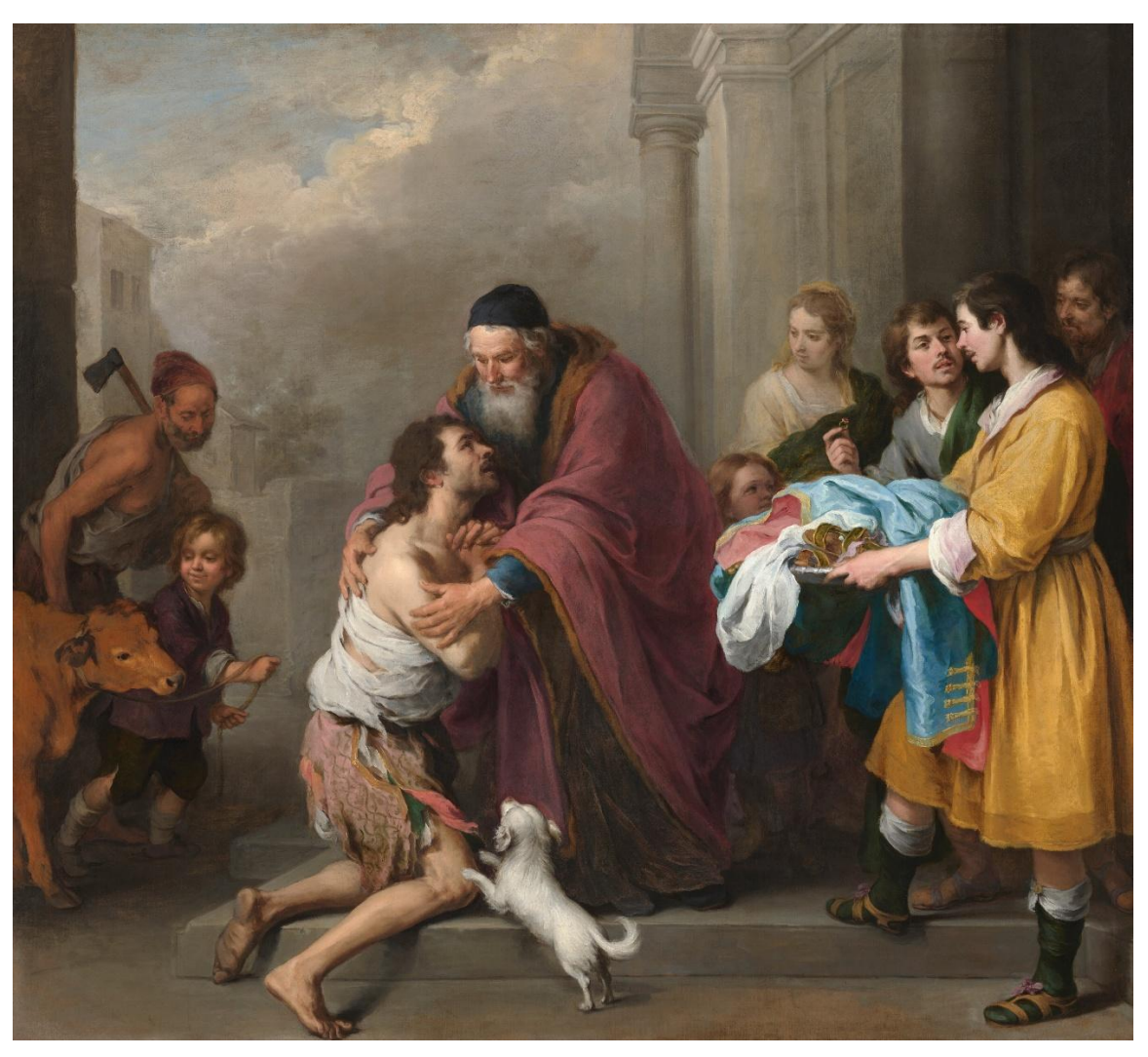
"The Return of the Prodigal Son," Bartolomé Esteban Murillo