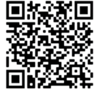
THIS WEEK'S ENEWS

A CHILD OF OUR TIME: CHORAL RESPONSES TO THE ST. LUKE PASSION will be offered by the Cathedral Choir at 4 p.m. this afternoon. This devotional performance is centered on two choral masterpieces: Quatre motets pour un temps de pénitence (Four motets for a season of penitence) by Francis Poulenc and Five Spirituals from A Child of Our Time by Michael Tippett.