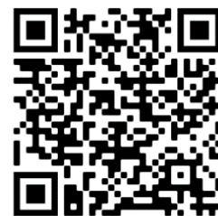
THIS WEEK'S ENEWS