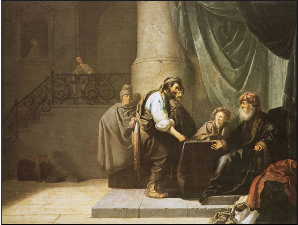
"Parable of the Talents" by Willem de Poorter