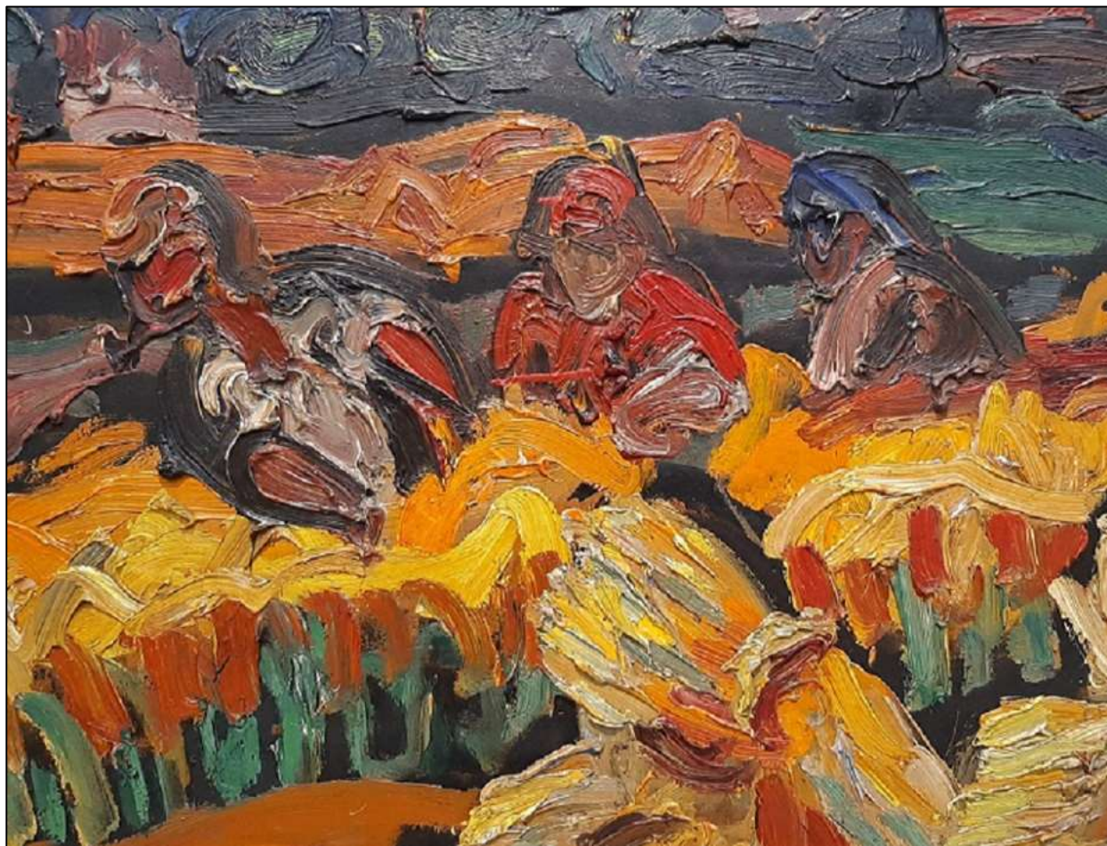
"Harvest" by Milan Konjovic

Holy Eucharist Thanksgiving Day November 24, 2022 at 10 a.m.