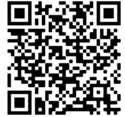
THIS WEEK'S ENEWS