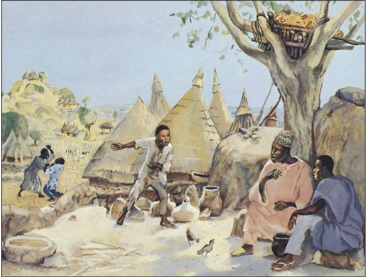
"The Unforgiving Servant" by Jesus Mafa

Holy Eucharist Sixteenth Sunday after Pentecost September 17, 2023 at 9 a.m.