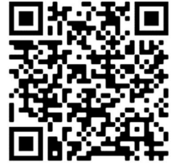
THIS WEEK'S ENEWS