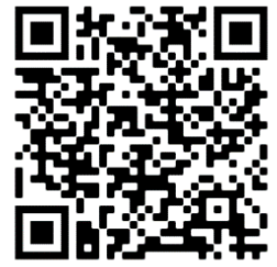
THIS WEEK'S ENEWS