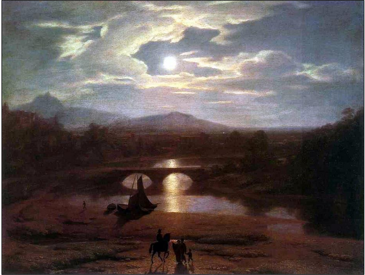
"Moonlight" by Washington Allston

Holy Eucharist First Sunday of Advent December 1, 2024 at 11 a.m.