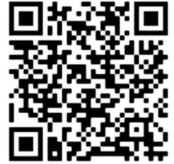
THIS WEEK'S ENEWS