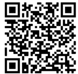
THIS WEEK'S ENEWS