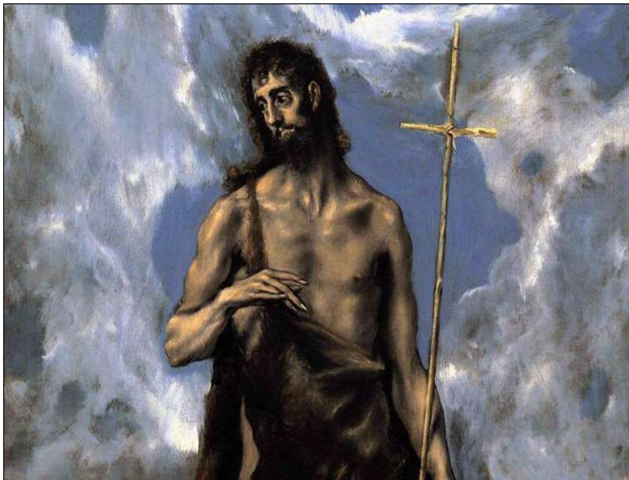
"John the Baptist" by El Greco

Holy Eucharist & Holy Baptism Eighteenth Sunday after Pentecost October 1, 2023 at 9 a.m.