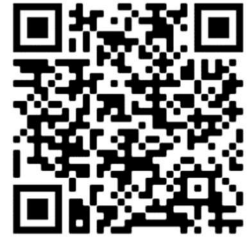
THIS WEEK'S ENEWS