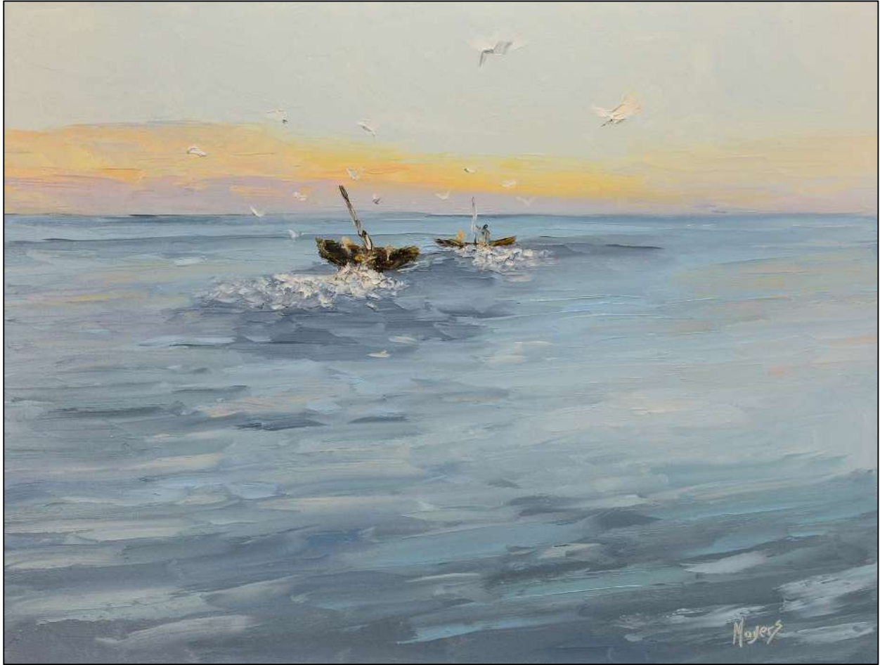
"Miracle Catch" by Mike Moyers