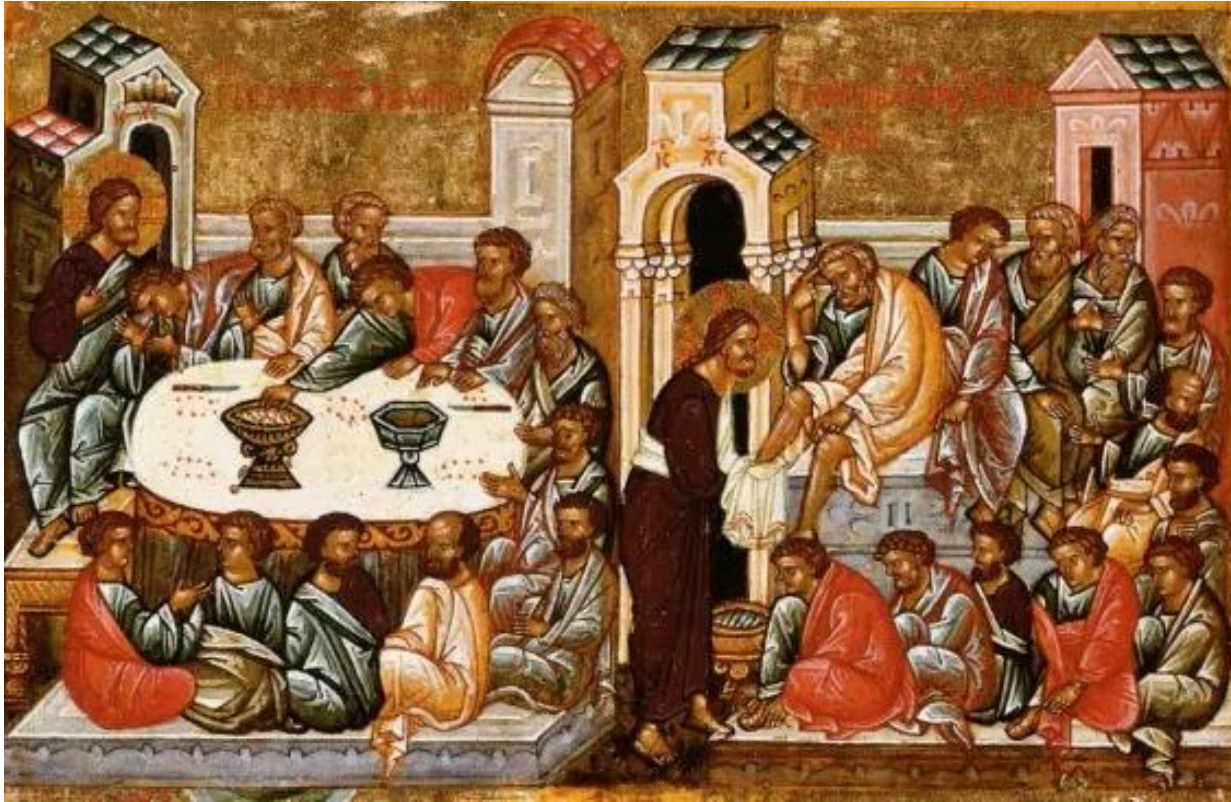
Segment of 15 th Century Icon