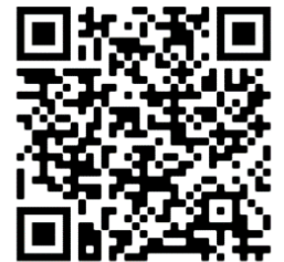
THIS WEEK'S ENEWS