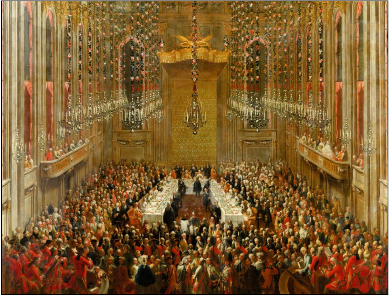
“Wedding Supper” by Martin van Meytens