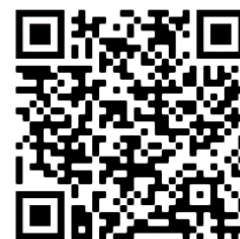
THIS WEEK'S ENEWS