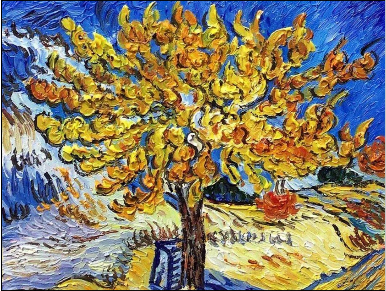
"The Mulberry Tree" by Vincent Van Gogh