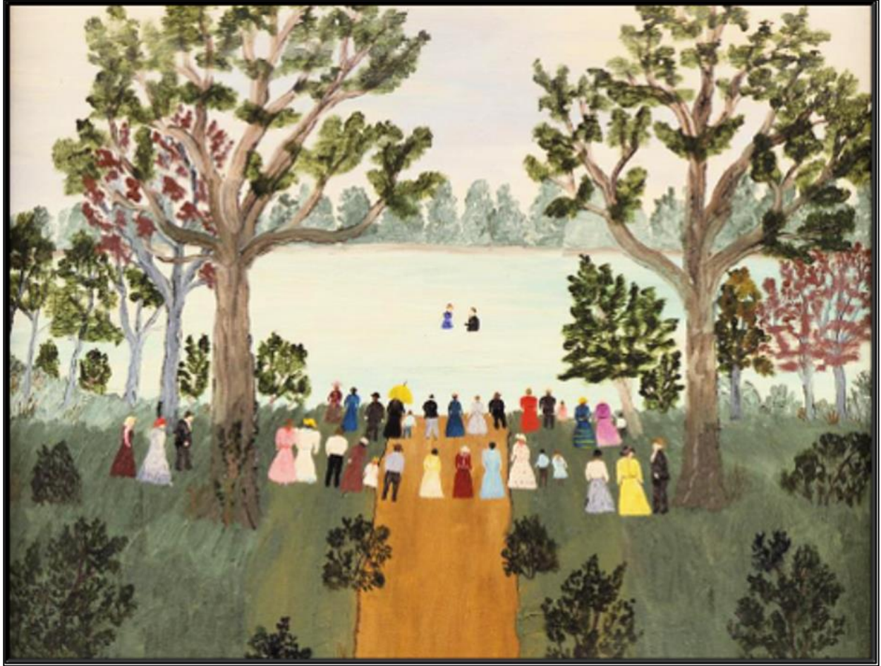
"Baptism in the Wabash" by Tella Kitchen

Holy Eucharist Second Sunday of Advent December 2, 2025 at 8 a.m.