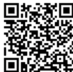
THIS WEEK'S ENEWS

CHRISTMAS AT THE CATHEDRAL Spend your Christmas at the Cathedral! See the graphic at the end of this bulletin or visit www.SaintJamesCathedral.org/Christmas for all the Cathedral has to offer this Christmas season.