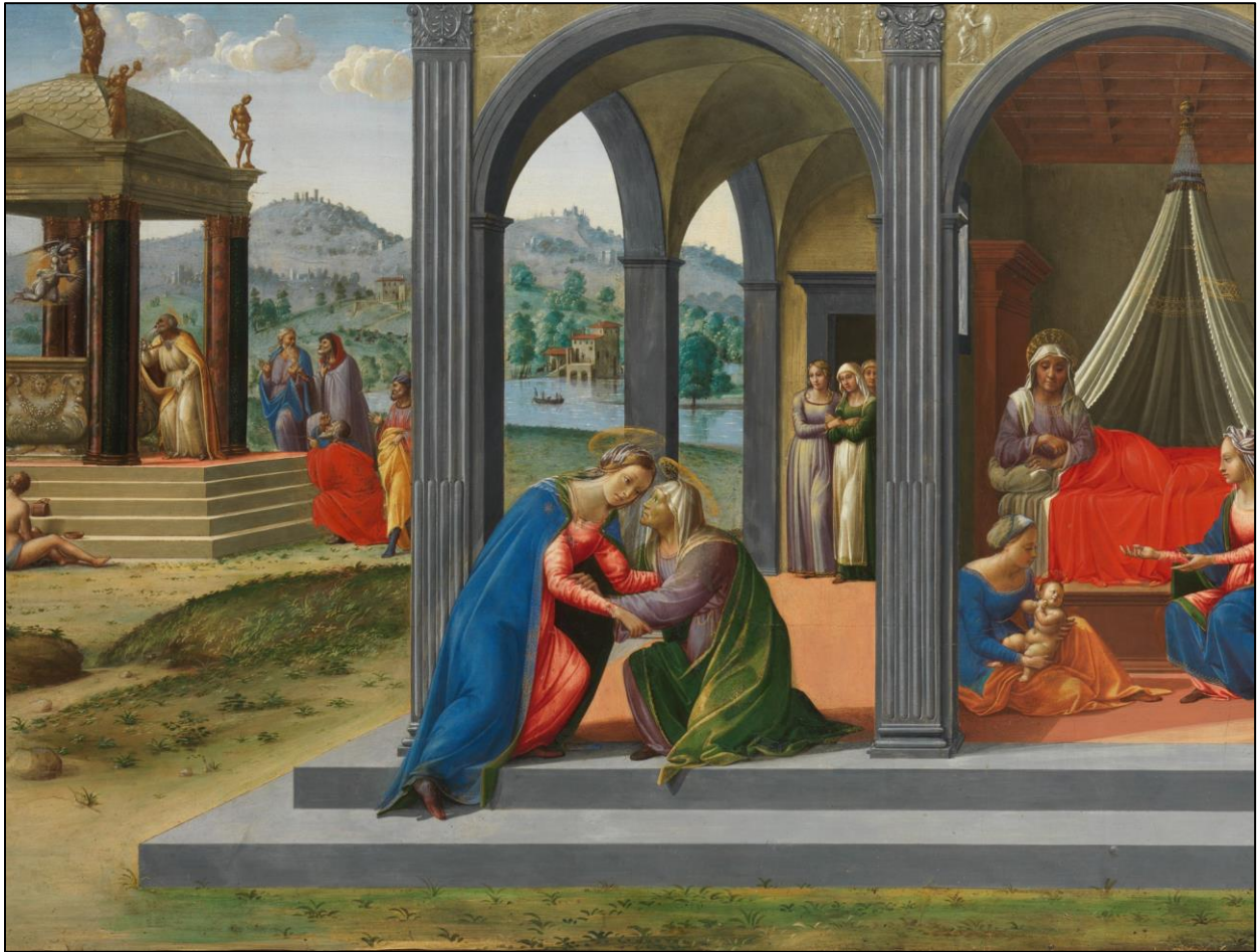
"Scenes from the Life of St. John the Baptist" by Francesco Granacci

Choral Evensong Evensong for Advent December 7, 2025 at 4 p.m.