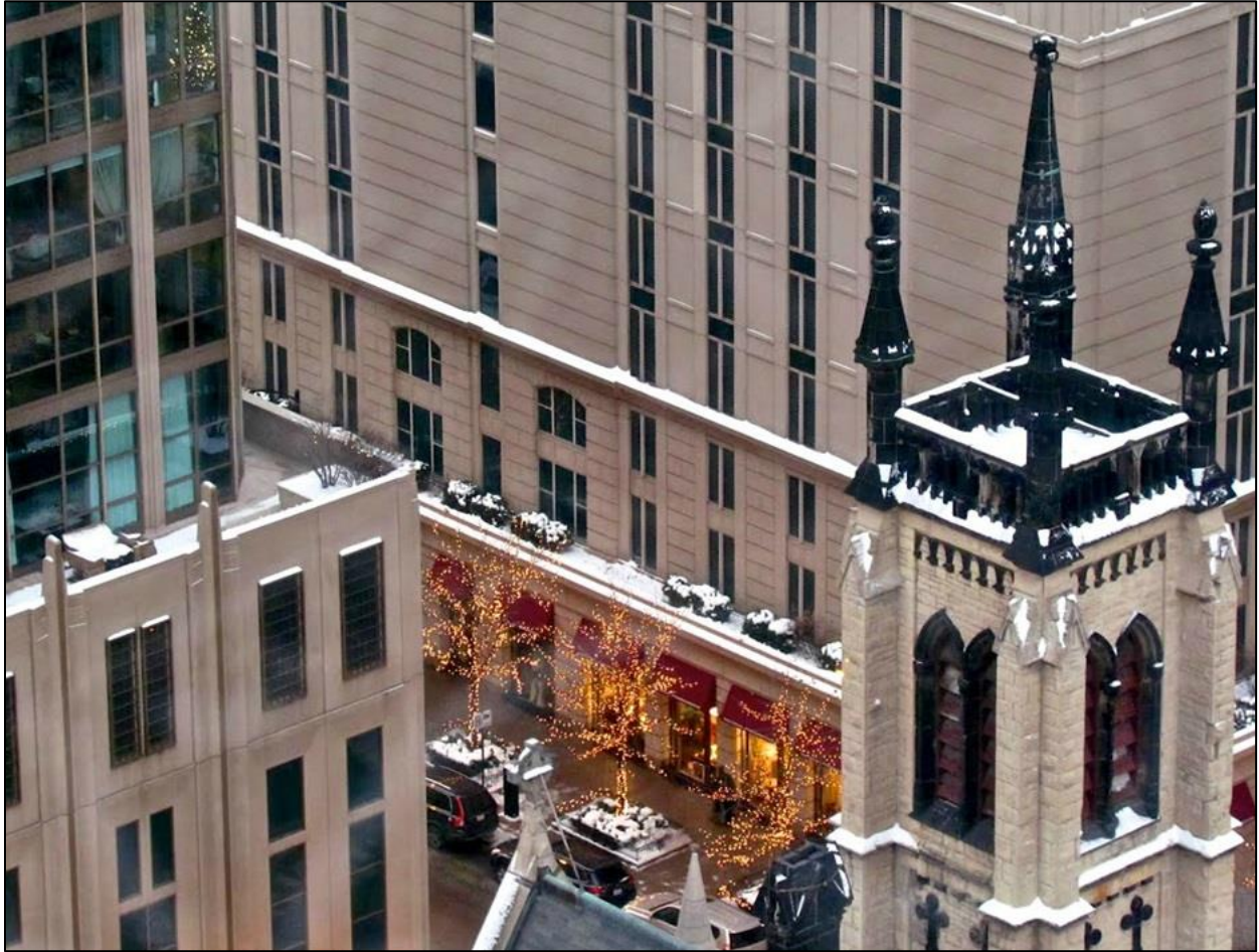
St. James Cathedral Bell Tower on a Snowy Day

A Festival of Nine Lessons & Carols December 21, 2025 at 4 p.m.