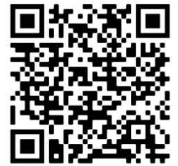
THIS WEEK'S ENEWS