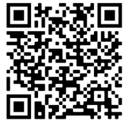
THIS WEEK'S ENEWS

CHORAL EVENSONG AT ROCKEFELLER CHAPEL SUNDAY, MAY 3 AT 4 P.M. Choral Evensong on May 3 will be celebrated at Rockefeller Chapel at the University of Chicago. The Cathedral Choir and Choristers join forces for Howells' iconic Collegium Regale setting of the evening canticles and music celebrating the legacy of Leo Sowerby, Hyde Park resident and Director of Music at St. James from 1927-1962.